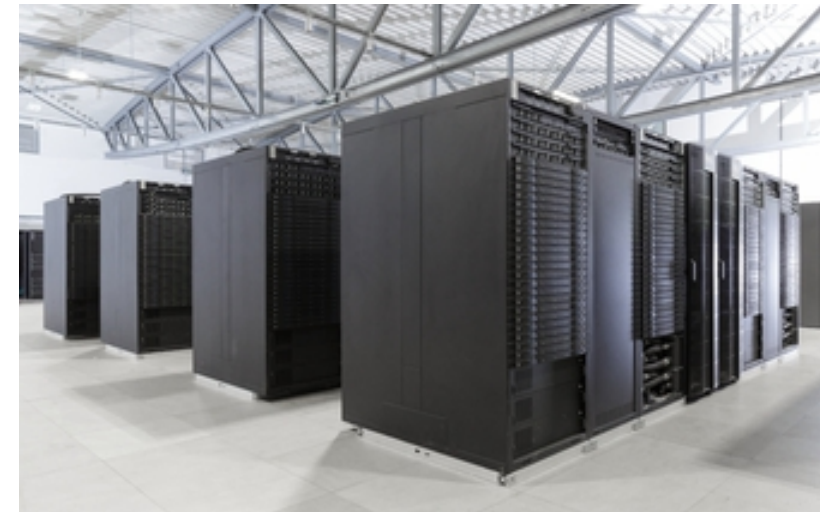
c) JUWELS Cluster