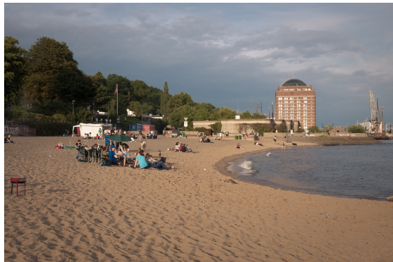
Foto: Elbstrand, Övelgönne