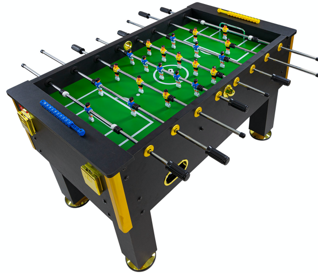
Table Soccer Championship Information