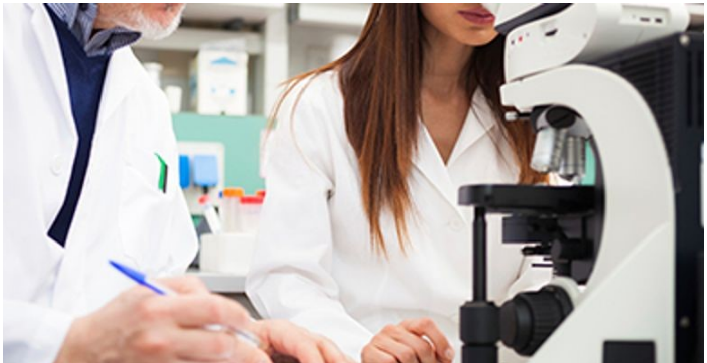
Training on statistical methods and study design is essential for reproducible research.

A number of significant efforts have been aimed at addressing the lack of reproducibility in scientific research. Individual researchers, journal publishers, funding agencies, and universities have all made substantial efforts toward identifying potential policy changes aimed at improving reproducibility 16,18,19,20,21 . What has emerged from these efforts is a set of recommended practices and policy prescriptions that are expected to have a large impact.