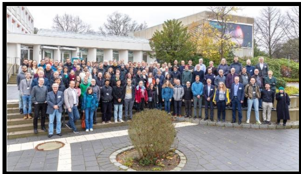
Strategy workshop “The future of collider Physics”